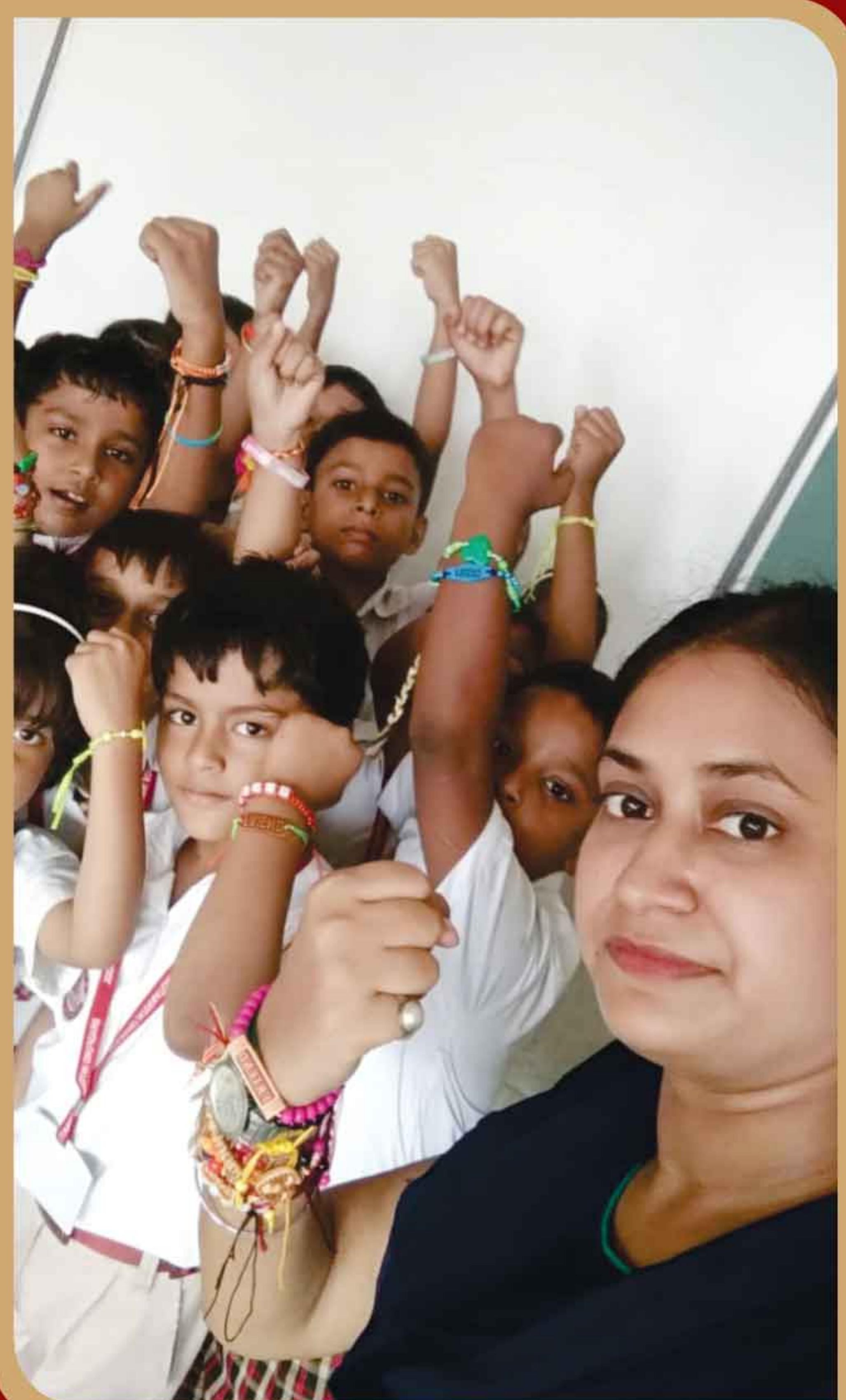
Raksha Bandhan Celebration