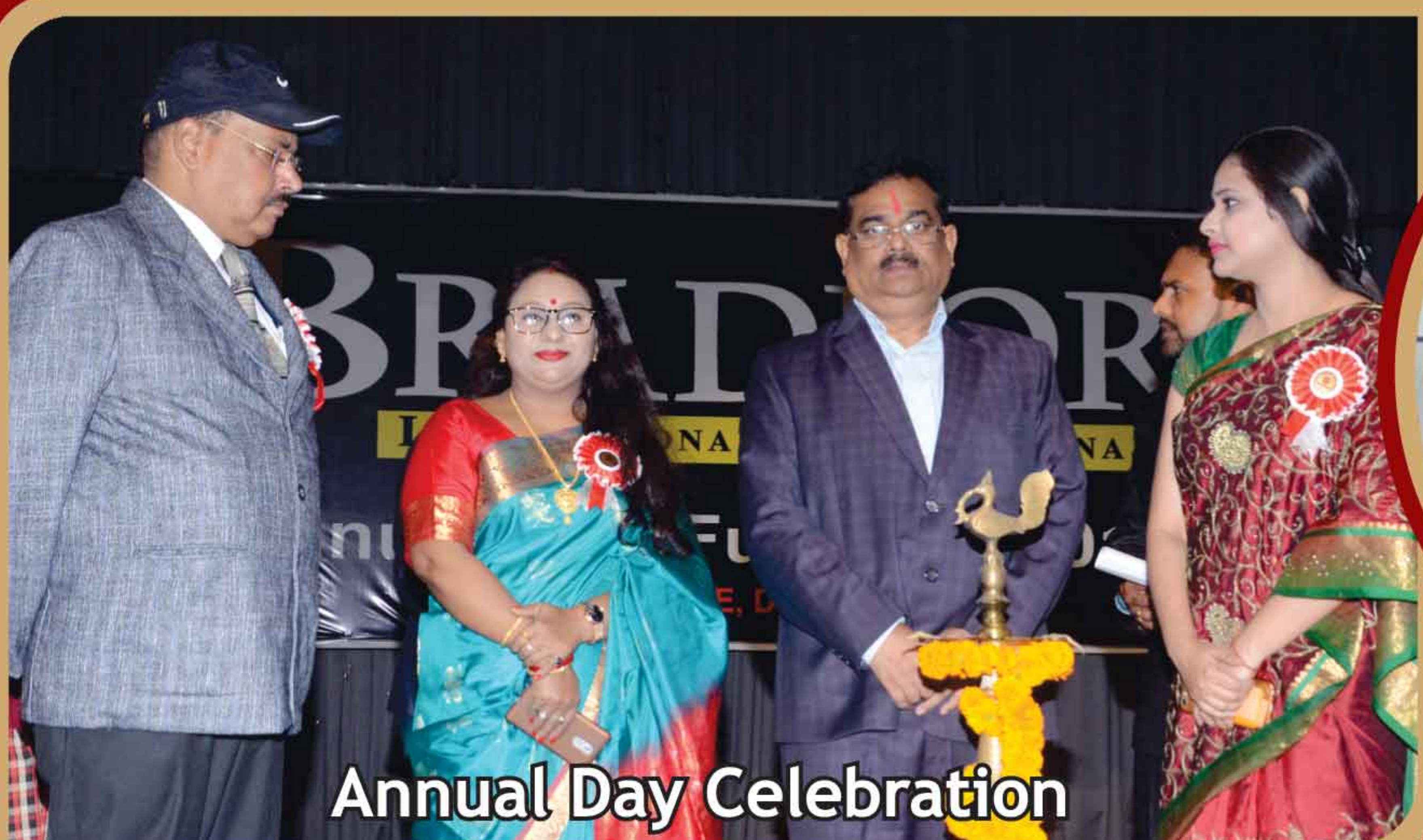
Annual Day Celebration