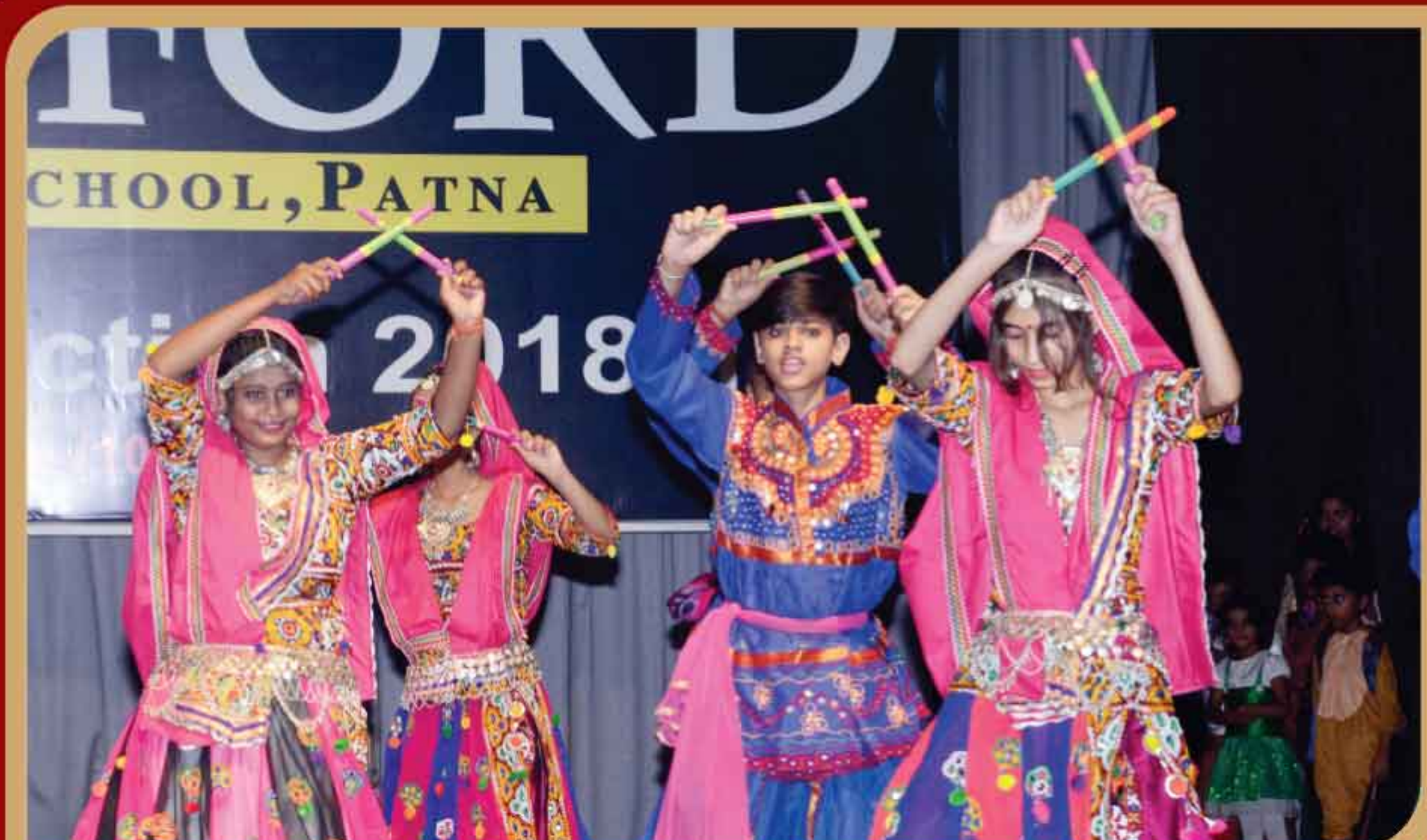
Dandia Day Celebration