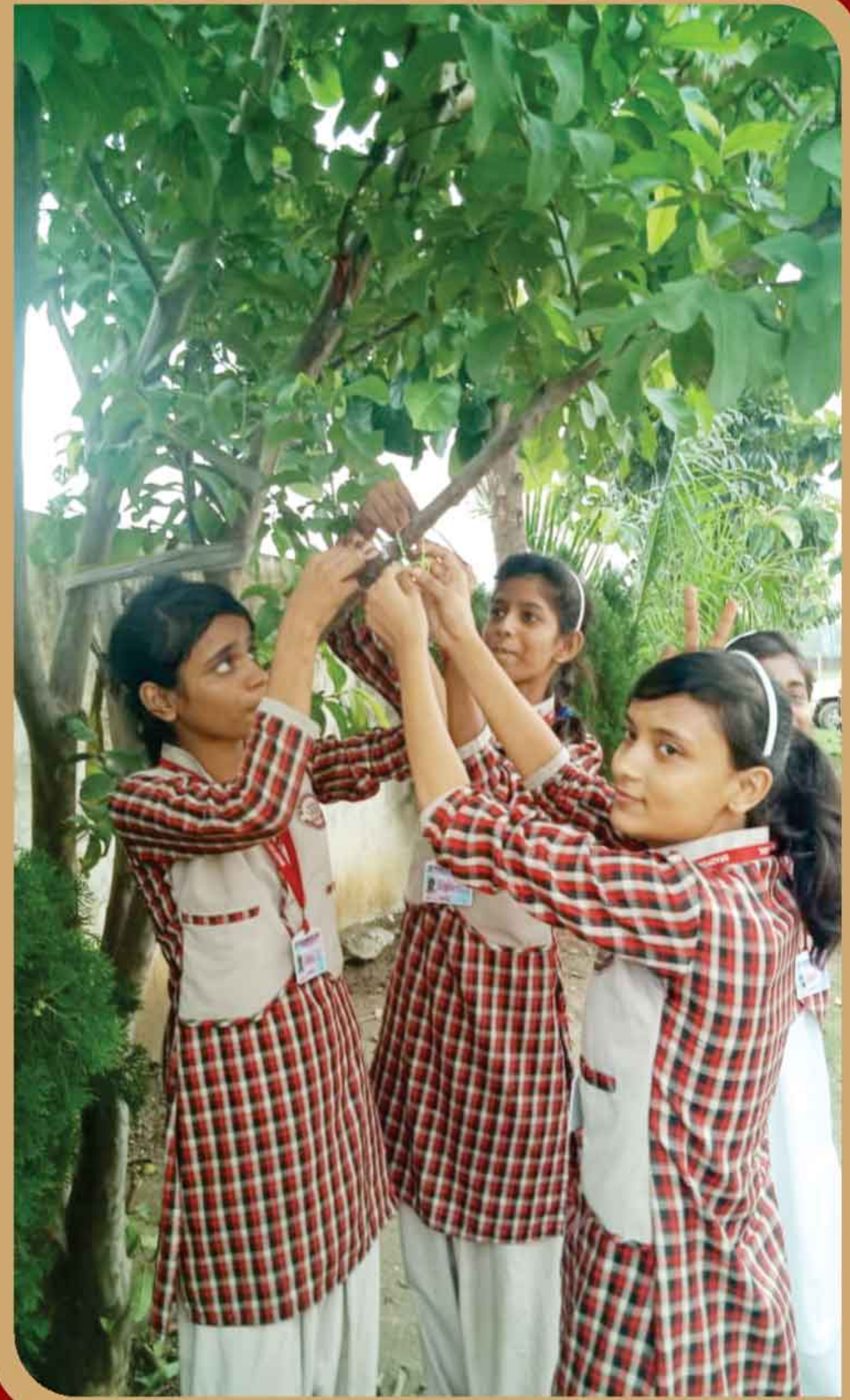
Green Day Celebration