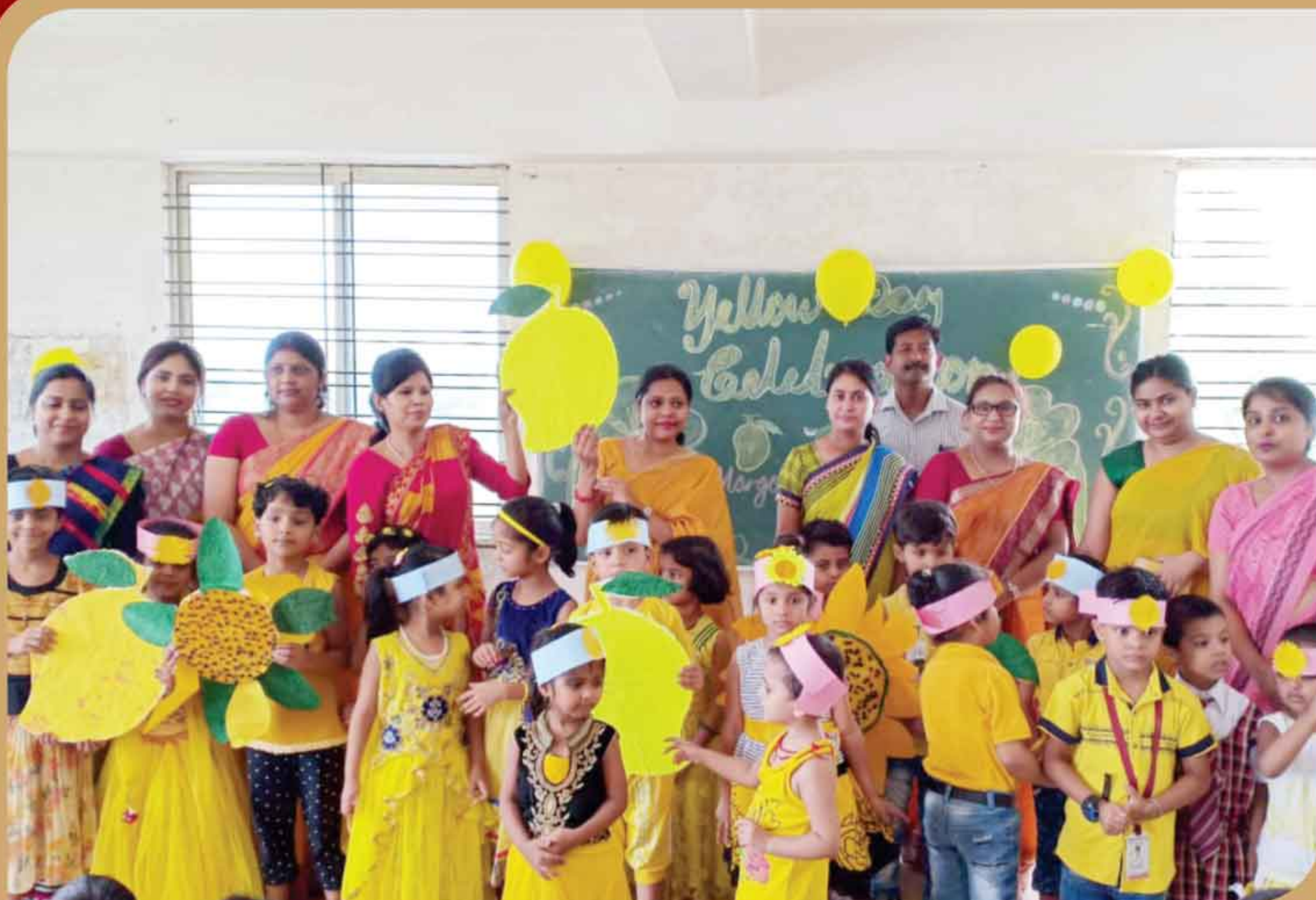
Yellow Day Celebration